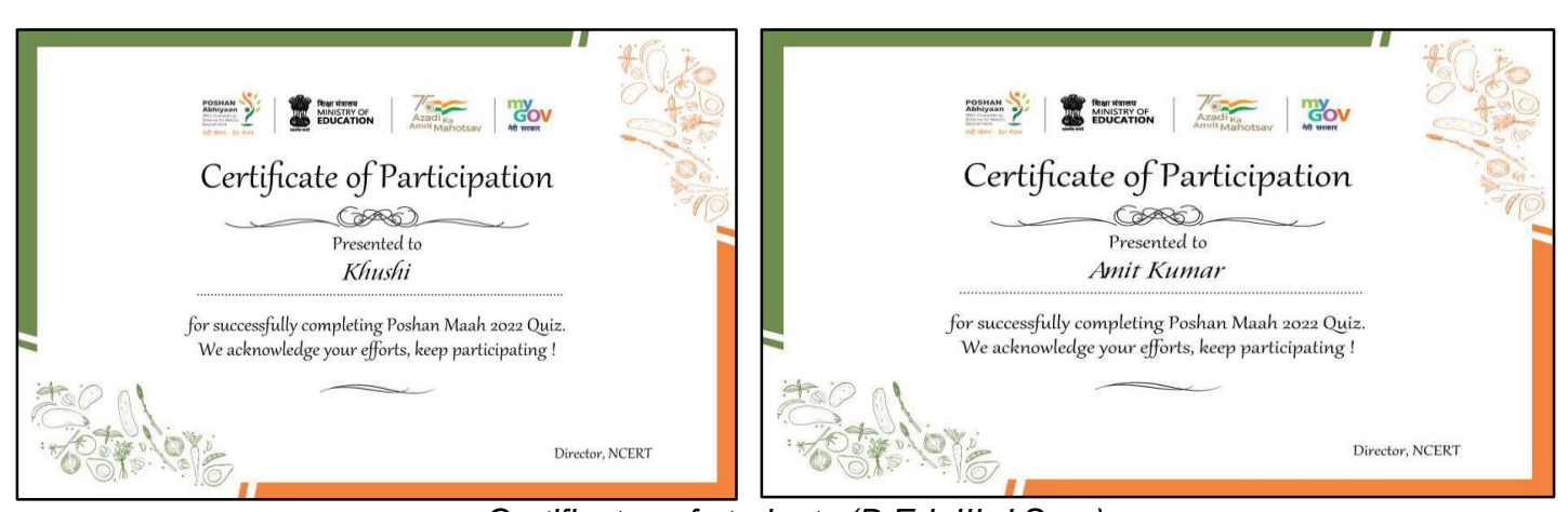
Certificates of students (B.Ed. IIIrd Sem)